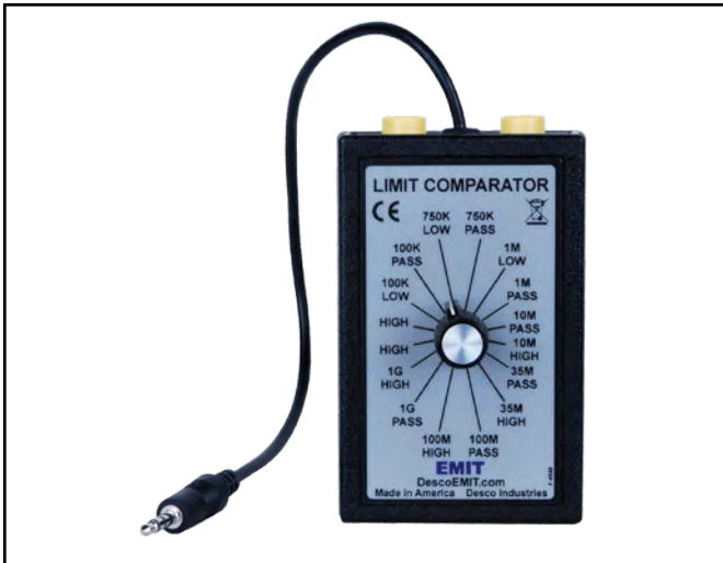
Figure 4. 50421 Limit Comparator

The Limit Comparator allows the customer to perform NIST traceable calibration on a number of Semtronics Testers including the 62106 . The Limit Comparator can be used on the shop floor within a few minutes virtually eliminating downtime, verifying that the Dual Independent Footwear Tester is operating within tolerances.