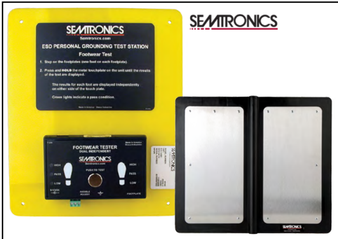
Figure 1. Semtronics Dual Independent Footwear Tester and Dual Foot Plate